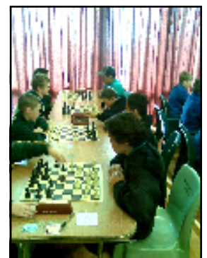
West Auckland Chess Tournament